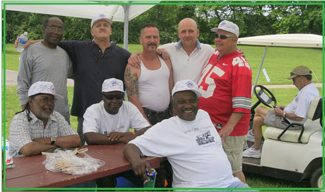
Resident volunteers at Armed Forces Day golf outing.

The VA approved our request for an additional 15 beds in the Marx Center to be part of their national Homeless Provider Grant & Per Diem Program. This new funding allowed JH to expand our Phase One program to 63 beds – providing food, housing and intensive clinical services in a safe and supportive environment.