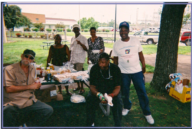
Residents and family enjoy July 4th picnic.

We started the fiscal year with 98 residents on 1 July 2010. During the year we accepted 121 homeless veterans into our program and discharged 110. Sixty-eight percent of those discharged completed 90 or more days of staying clean and sober and stayed on our campus an average of 10.2 months.