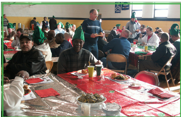
Residents at St. Paul church for Christmas.

At 30 June, we have 109 residents. Fifty-five have over 1 year at Joseph House, and 35 have less than 90 days. Forty-one of our residents are working, 27 are on VA disability, 2 are on Social Security retirement, and one has military retirement. Thirty-eight residents have no income. Most of those with no income are "new guys" who have less than 90 days at JH.