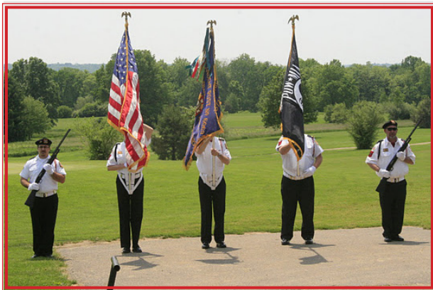
VFW Post 6069 color guard opening our Armed Forces Day Golf outing.

The Department of Veterans Affairs raised our per diem rate and conducted their annual inspection of our operation with zero reportable findings for the fourth consecutive year. Our two HUD grants were renewed. We continued our collaboration with Greater Cincinnati Behavior Health to execute a special effort to identify homeless mentally ill veterans living on the streets and to connect these veterans with mental health services. While the state has terminated the funding for this demonstration project, we continue to work with GCBH to conduct this outreach.